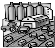
2009 PA Farm Show January 10-17

Market hogs, lambs and goats must be identified with an RFID Tag and entries postmarked by October 15th. There will be a mandatory tagging on Tuesday, October 7th at the fairgrounds between 6:30 and 8:30 p.m. All market animals being entered for farm show must be tagged at this time.