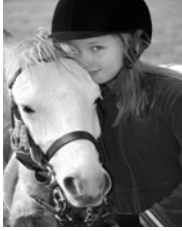
PA State 4H Horse Show October 23, 24 & 25