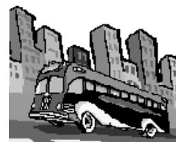
Fall Ag Study Tour Taking Applications

stops at producers, agribusinesses and Land Grant Universities. The experience is to increase awareness of Ag Careers, improve communication skills and develop job seeking skills. The member will be responsible for their own meals and personal needs during the trip. The trip is being supported by the Jr. Livestock Show and Sale Committee.