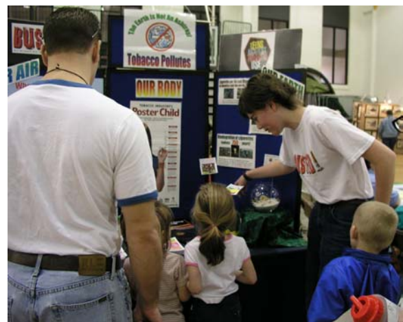
“The Earth Is Not An Ashtray” 4-H County Council & BUSTED!TATU