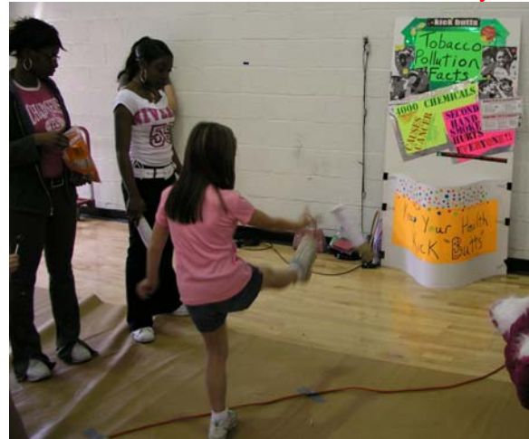
“Keep Your Health - Kick Butts” Communities That Care Teen Leaders